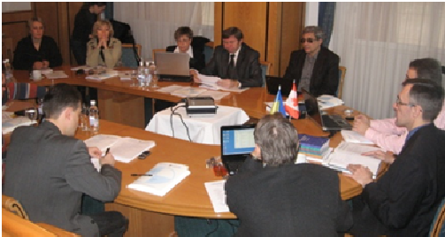
2nd ToT Working Group meeting in December 2010, Kyiv

First, having participated in the project's training, coaching, mentoring, and learning-by-doing programs, participants in RGD's earlier training programs gained solid skills and experience in strategic planning, community engagement, partnership building, capital investment programming and project management. RGD recruited the top candidates to become members of the ToT Working Group , responsible for developing the curricula of the ToT Program. This