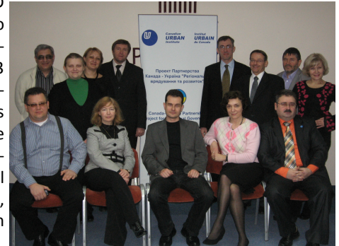
3rd ToT Working Group meeting in February 2011, Kyiv

NGOs and other technical assistance projects. 11 were published as manuals and professional publications, and are accessible on RGD's website. As a result of this extensive repertoire of publications, RGD helped to build a body of knowledge in Ukraine on participatory strategic planning and regional development. And that is now the foundation of the ToT Program and the NTP that will eventually be delivered to over 600 civil servants and regional stakeholders across Ukraine.